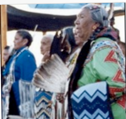
MANITOBA CHIEFS IN CANADA

Women volunteers in Hyderabad are planting trees, recycling paper and plastics and making handicrafts with recycled materials.